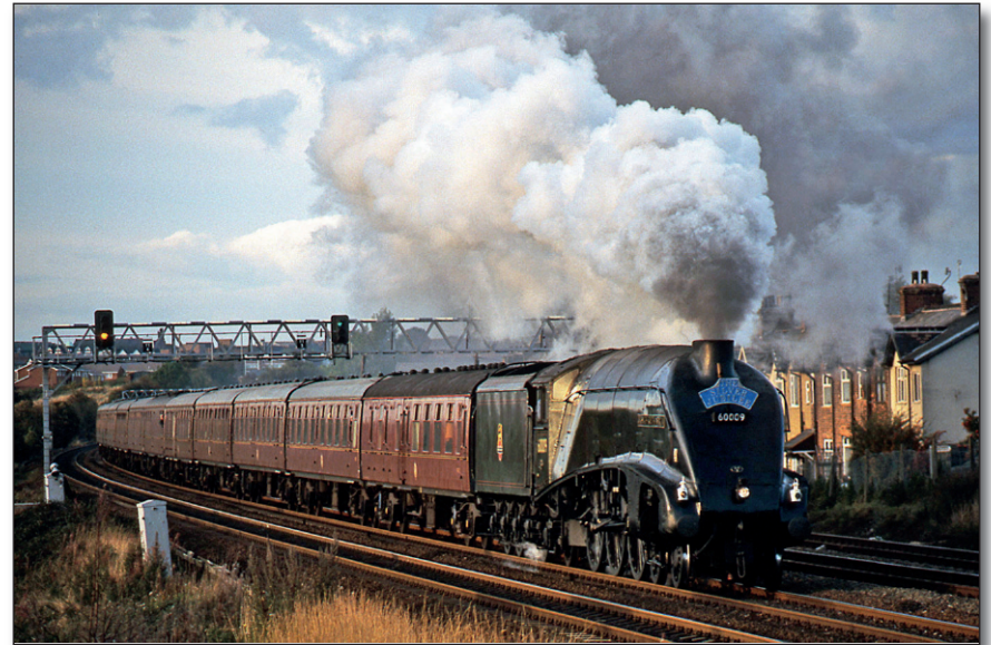
No.60009 'Union of South Africa' at Hasland, Chesterfield in October 1996.