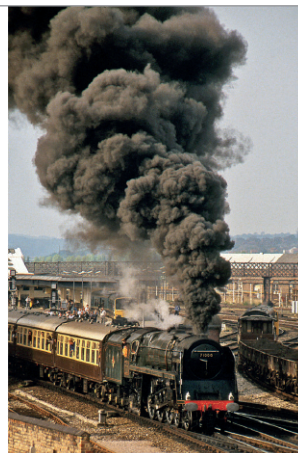
No.71000 'Duke of Gloucester' makes a spectacular departure from Derby Station with its second train for Dorking in April 1990.