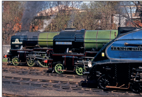
Above: 'Tornado', 'Blue Peter' and 'Sir Nigel Gresley' are bathed in spring sunshine in their early British Rail liveries in April 2009.