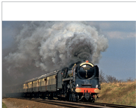
No.71000 'Duke of Gloucester' powers south from Derby with its very first mainline steam special in preservation, with a train bound for Dorking, in April 1990.