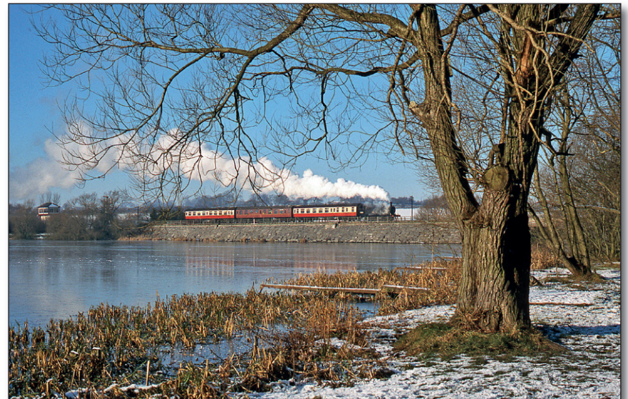
A tree at the side of Butterley Reservoir frames No.47327 in December 2001.